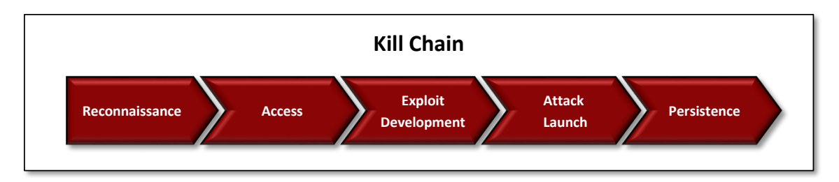
Figure 2. Cyber kill chain.